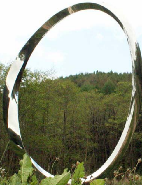
Public Vote Winner 2011: Endless Curve by Wenqin Chen

For further information please email info@broomhillart.co.uk