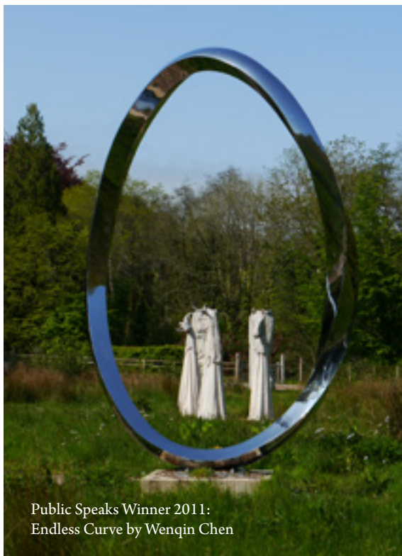
Public Speaks Winner 2011: Endless Curve by Wenqin Chen